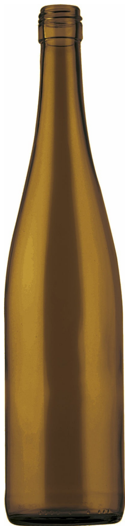
ANTIQUE GREEN T1120082