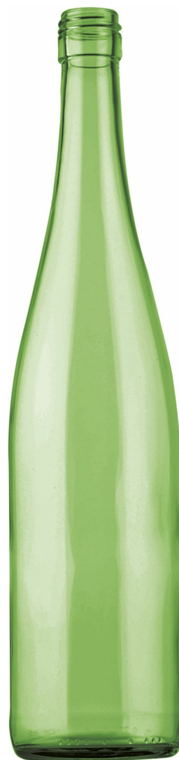
GREEN BEER EMERALD G3I20082