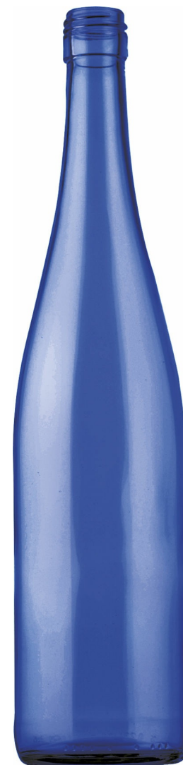
LUXURY ROYAL BLUE S0I20082