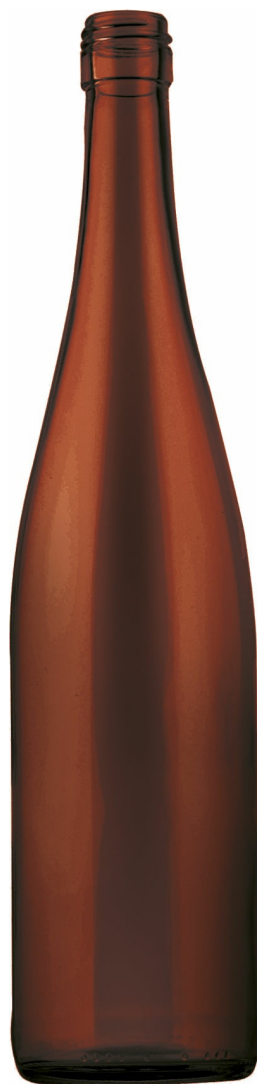
AMBER DARK A2I20082