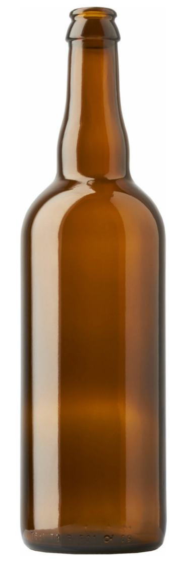
AMBER BEER A1131126