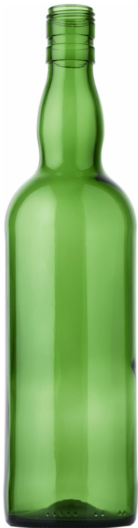
GREEN BEER EMERALD