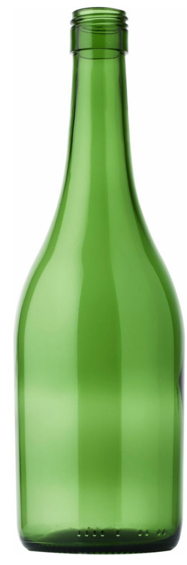
GREEN BEER EMERALD G3140191