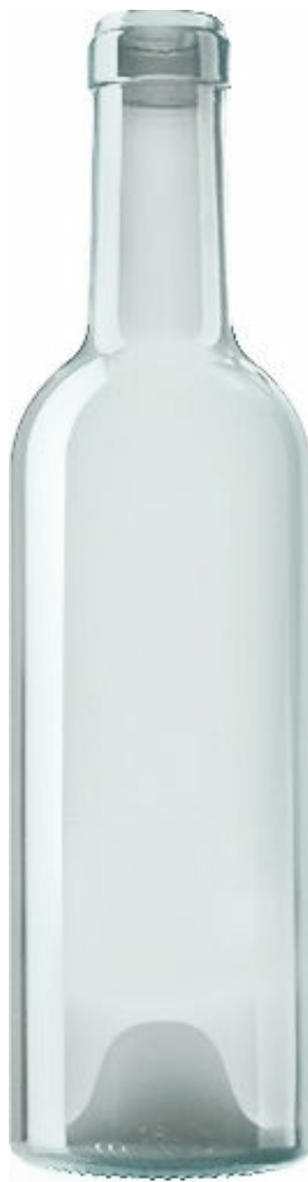
HALF FLINT F2007110