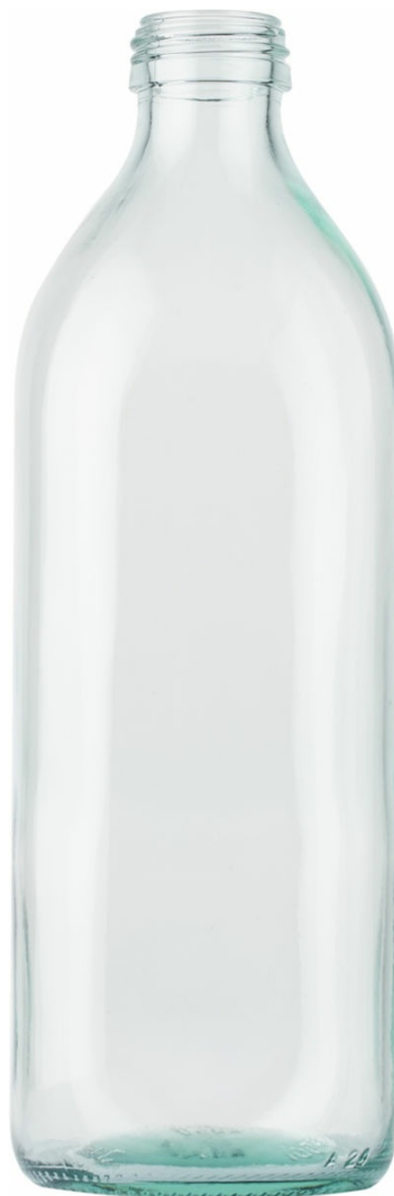
HALF FLINT F2007464