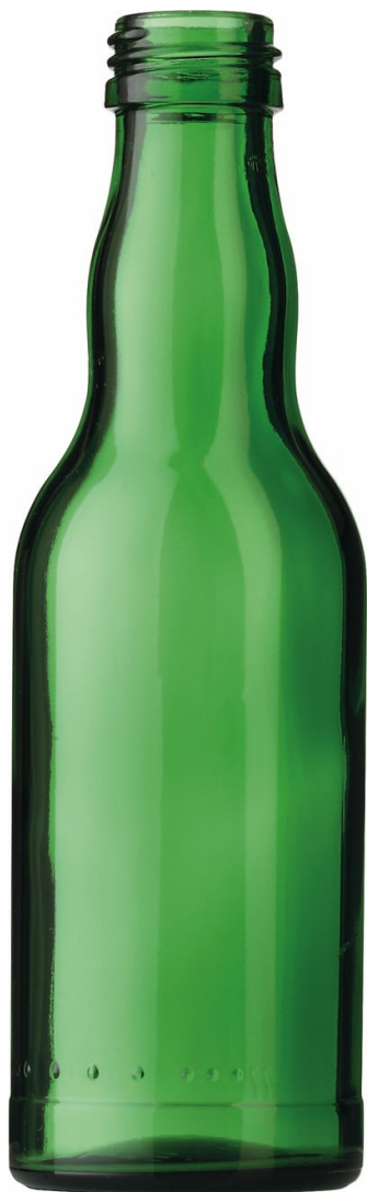
GREEN BEER EMERALD