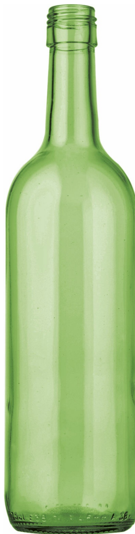
GREEN BEER EMERALD G3110325