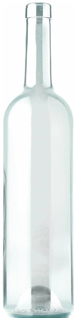
HALF FLINT F2120362