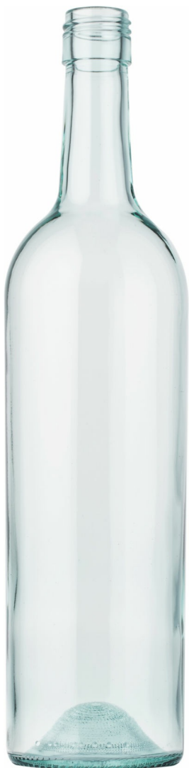
HALF FLINT F2178307