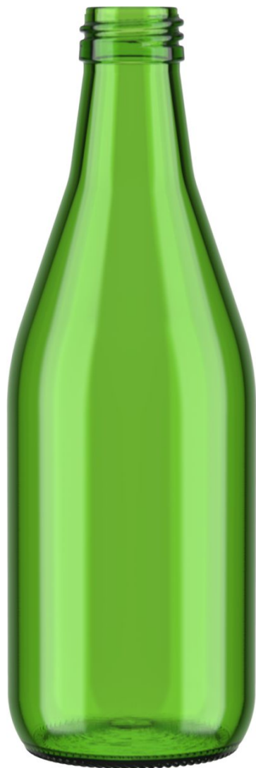
EMERALD GREEN G8500029