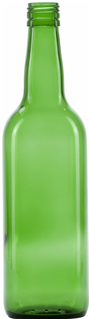
GREEN BEER EMERALD