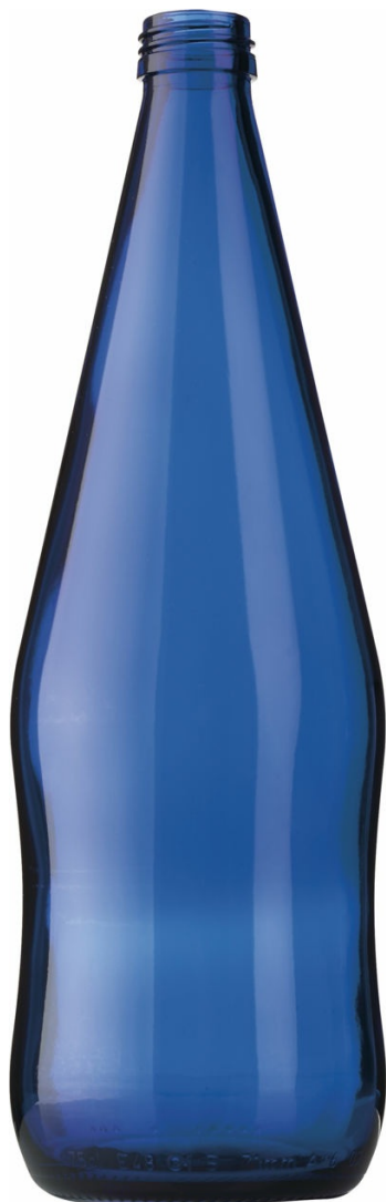
LUXURY ROYAL BLUE