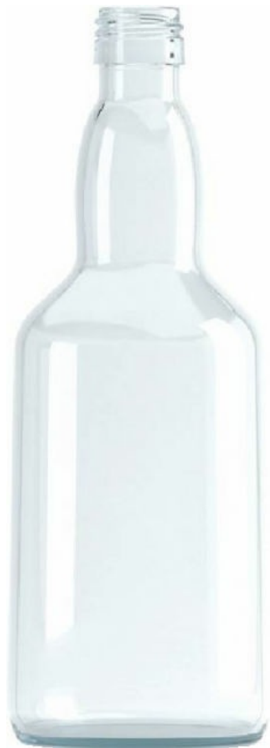
FLINT - INDUSTRIAL 1200