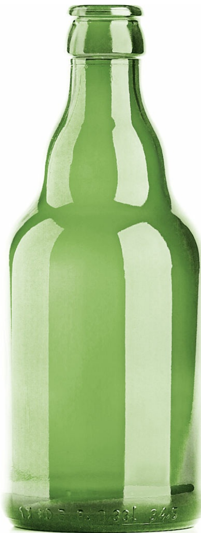
GREEN BEER EMERALD